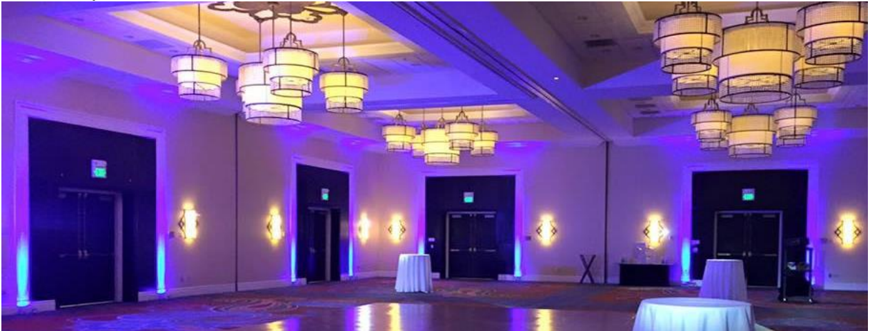
UPLIGHTING SAMPLE- YOU CHOOSE FROM MANY COLOR COMBINATIONS